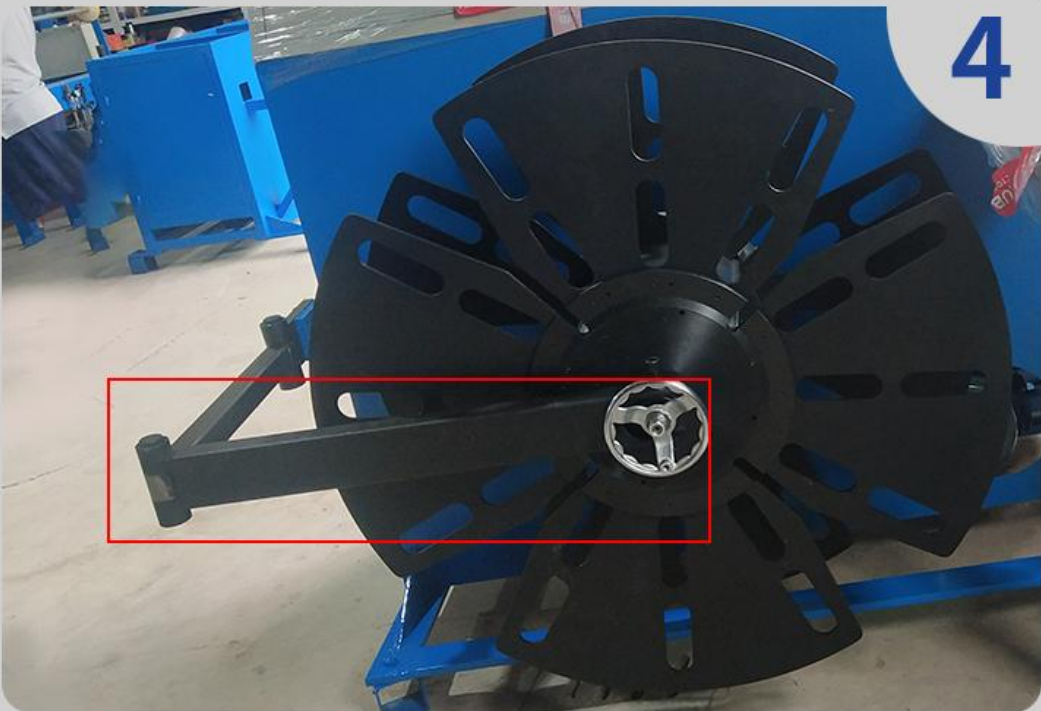
A support to stabilize the coil